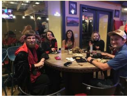
A fun night for everyone!

Moore Republican Women is a proud member of the NC Federation of Republican Women , the National Federation of Republican Women , and the Frederick Douglass Foundation of NC